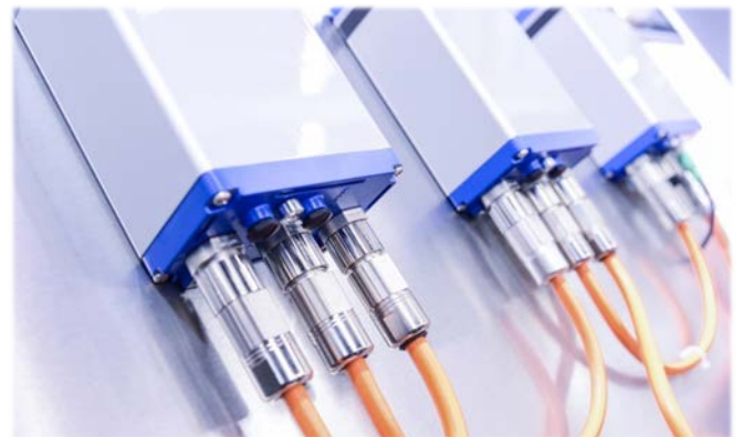
Kollmorgen specifically designed the distributed servo drives for AKD-N range as distributed devices, so that there are no deductions in power density.

motor cabling. Two other advantages are improved EMC-behavior and the widespread distribution of heat loss, reducing the cost or need for a centralized cabinet climate control system.