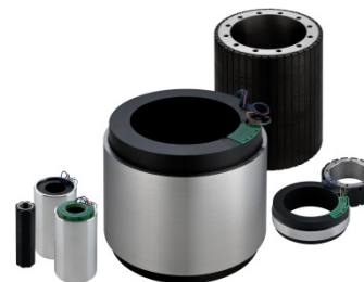
The torque motors in the KBM series reveal their full strength when it is really tight in machines. These advantages work very well in connection with the decentralized AKD-N servo drives.

The AKD -N series Kollmorgen drives provide IP67 protection and connection via an eleven millimeter diameter hybrid cable to the central supply module in the control cabinet. This single cable provides power and communications without the need for any additional cabling. Each AKD-C supply module can support two strings of AKD-N drives up to 4 kW each and up to 8 AKD-N drives per string. Safe Torque Off shutdown performed via the hybrid cable comes as standard, and can be implemented for each drive individually or as group. Also, only one cable is necessary between the distributed servo controller and its connected motor thanks to a new single-cable